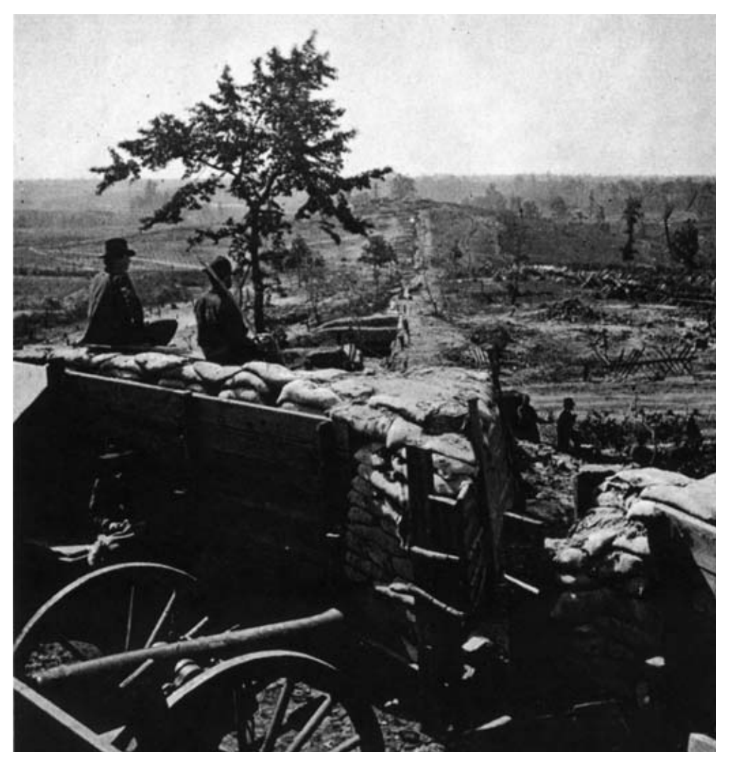
In a stark contrast to the days when Sherman's troops occupied this Confederate fort outside Atlanta, the city's rappers now have invaded the rest of the country's hip-hop scene, burning up the charts, unfurling the Dirty South's banner, and spreading its culture across the nation as they southernize Hip-Hop America.