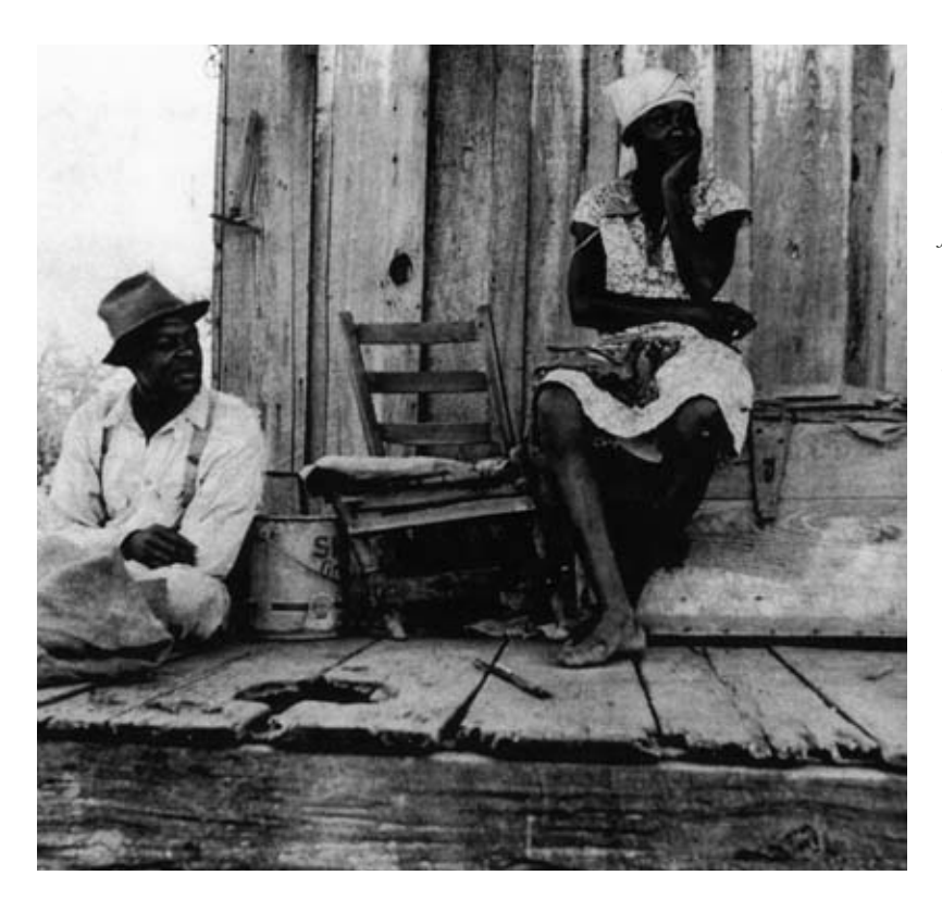
With his 2001 debut album Dark Days, Bright Nights, Bubba Sparxxx attempted to remind his listeners that the rural South suffered from the same problems of economic deprivation and social exclusion that troubled the region's urban ghettos.

Unlike the cerebral rap of Goodie Mob and OutKast, or the "country-fried" pursuits of rural rappers, crunk was urban party music. Frenetic, bass-heavy, and