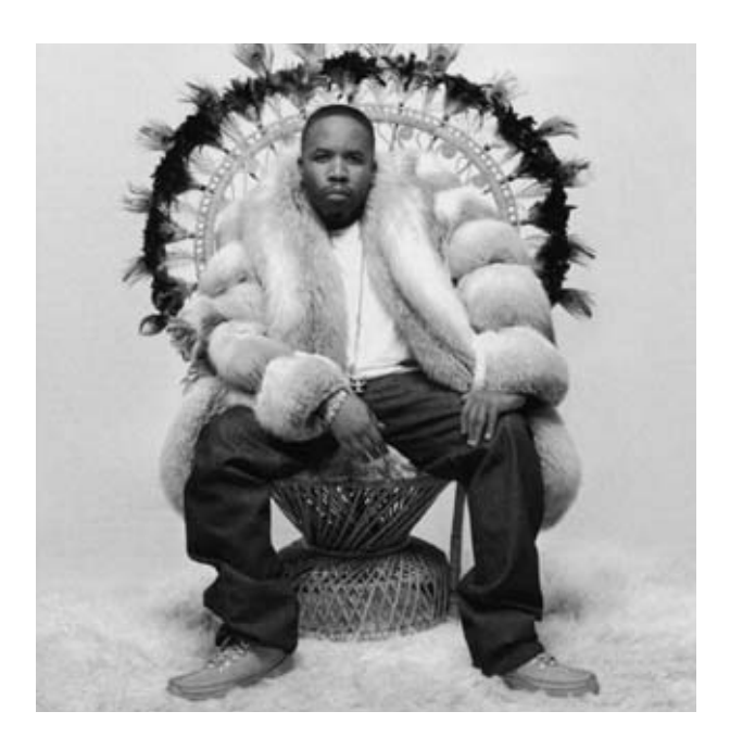
In 2004 OutKast won six Grammys, including an "Album of the Year" award, for their multi-platinum fifth effort, Speakerboxxx/The Love Below (here), from Arista.

fans of mainstream East and West Coast rap either ignored Atlanta's assortment of local rappers or considered its collection of "nice rappers" better suited for selling singles to sensitive listeners than for setting trends. If Atlanta rap was to become a serious distributor of mass-market rap, it needed more than just local or temporary appeal. More than anything, it needed a figurehead, a business leader committed to turning Atlanta rappers into market leaders.