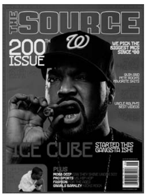
Although hip-hop magazines, such as Vibe and The Source, occasionally included interviews with southern artists or favorable reviews of southern rap albums, in the early days they usually did not give the Dirty South much more than passing coverage.